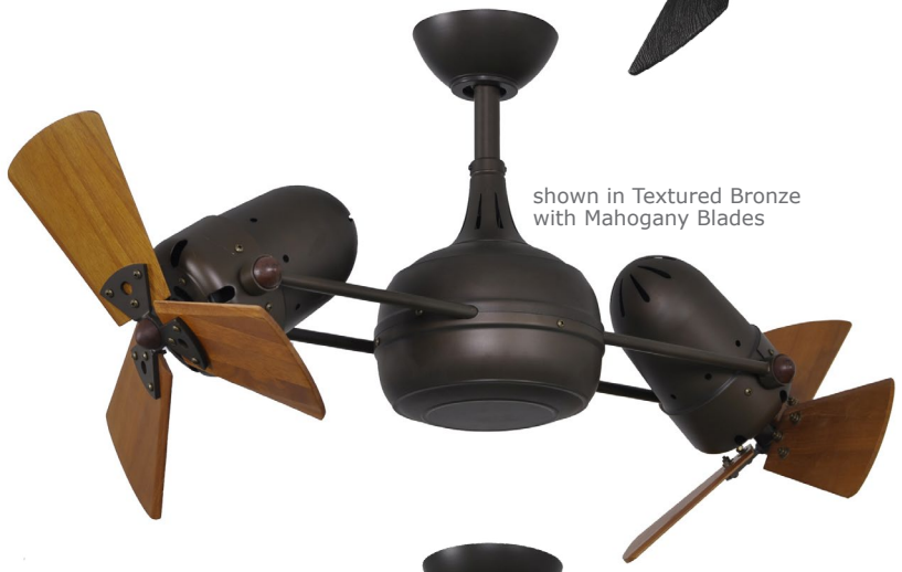
shown in Textured Bronze with Mahogany Blades