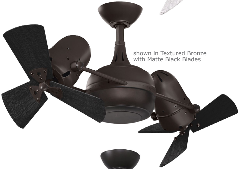
shown in Textured Bronze with Matte Black Blades