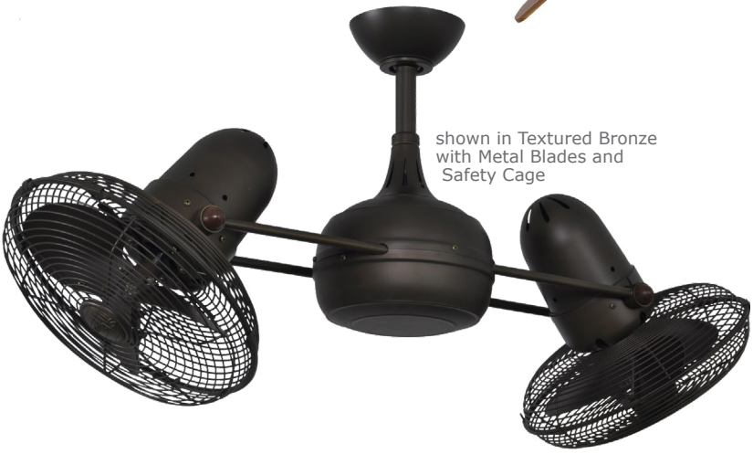
shown in Textured Bronze with Metal Blades and Safety Cage