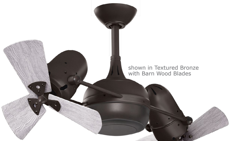
shown in Textured Bronze with Barn Wood Blades